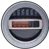
6 Wattage Select